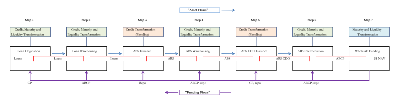
Figure 3: The Shadow Credit Intermediation Process