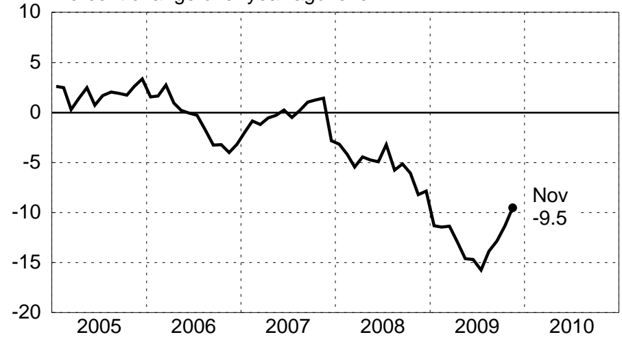
Industrial Production Percent change over year-ago level