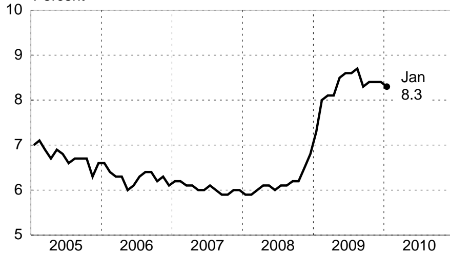
Unemployment Rate Percent