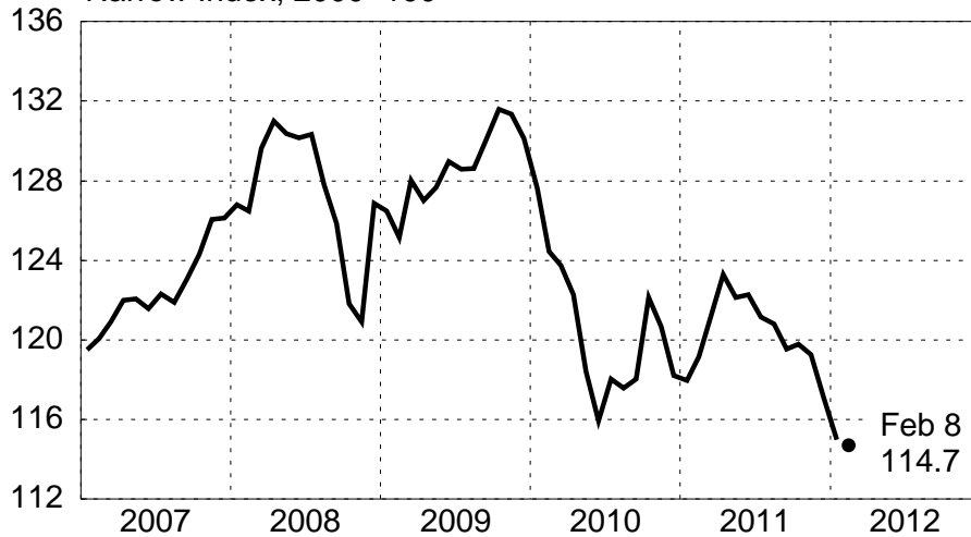
Nominal Effective Exchange Rate Narrow Index, 2000=100