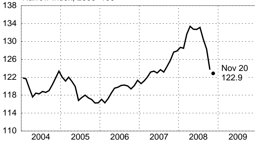
Nominal Effective Exchange Rate Narrow Index, 2000=100