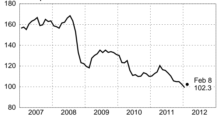
Yen per Euro