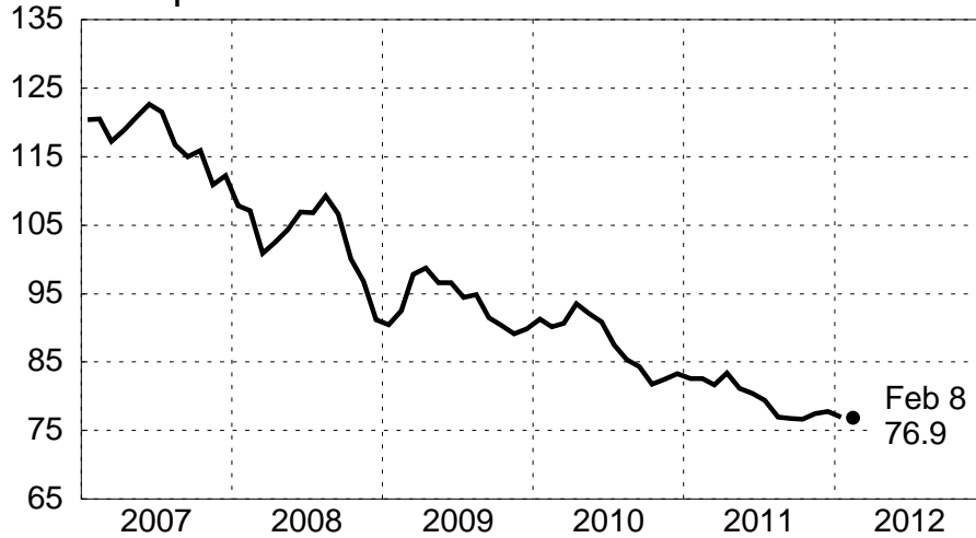
Yen per Dollar