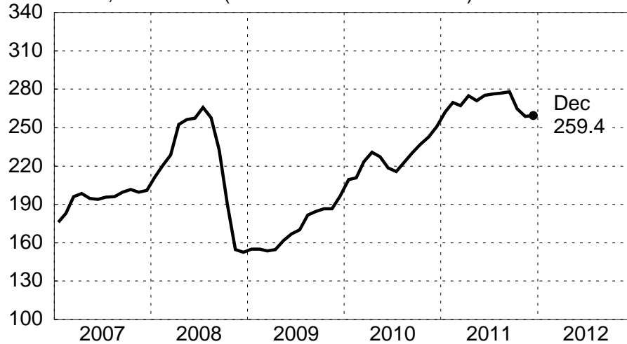
U.S. Producer Prices for Raw Materials Index, 2000=100 (Bureau of Labor Statistics)