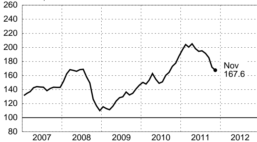
IMF Commodity Price Index (Excluding Fuels) Index, 2000=100