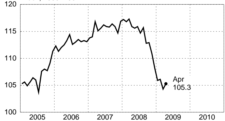
Industrial Production Index, 1993=100