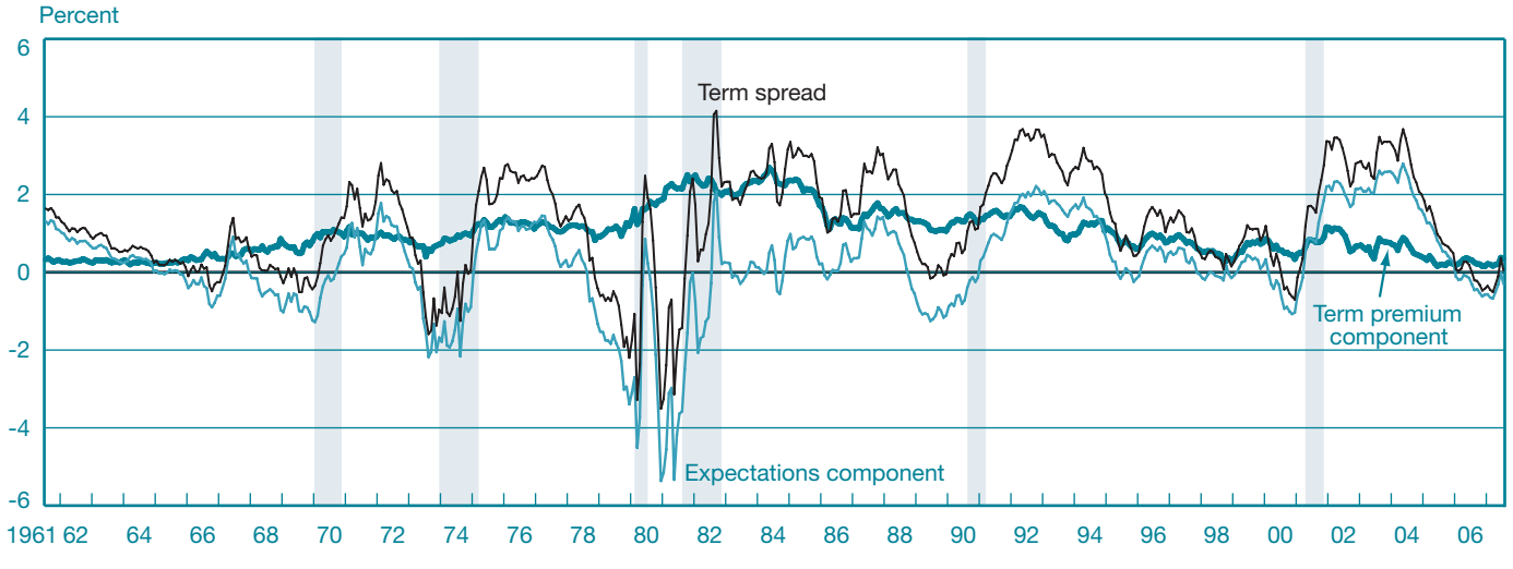
CHART 1 Term Spread and Components