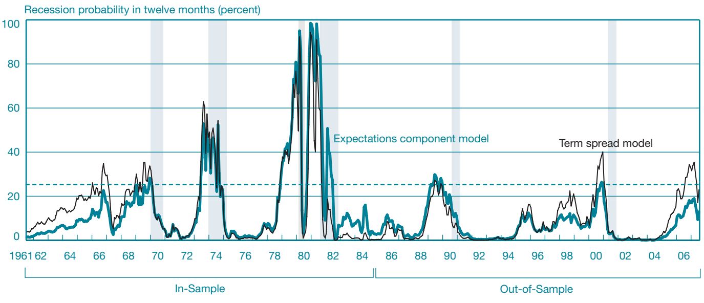
CHART 3 Out-of-Sample Recession Probability Forecasts