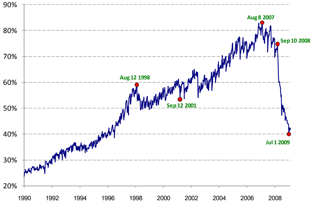
Figure 3: Repos and Financial CP as Fraction of M2 (weekly)