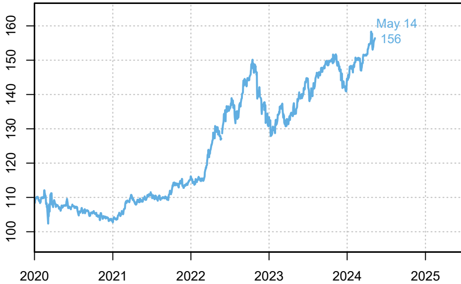
Yen per Dollar