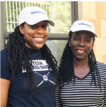
Lending a hand in our community.