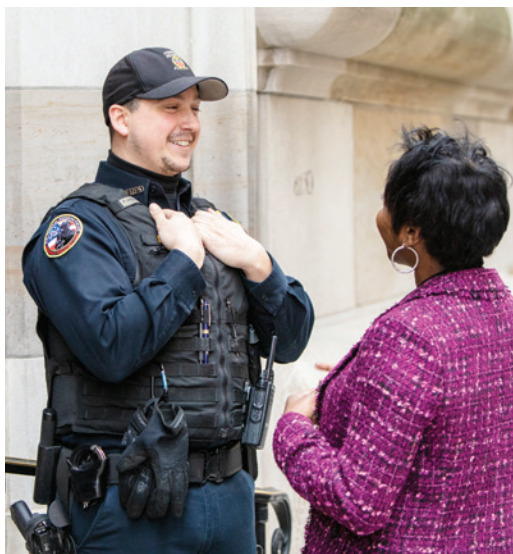
Protecting the New York Fed.

The BANK APPLICATIONS FUNCTION makes recommendations on how the Federal Reserve addresses a number of proposals by domestic and foreign banking organizations, and helps form Fed policy on application matters. This function also educates local and foreign banking communities on U.S. laws and regulations.