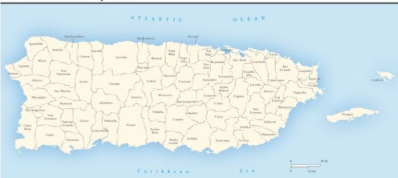
Puerto Rico Municipalities