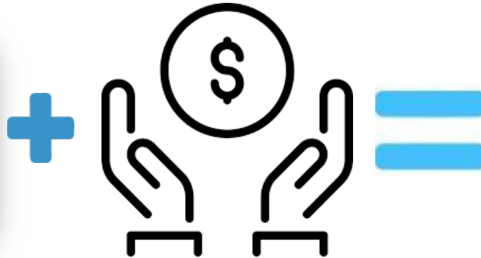
Access to Capital