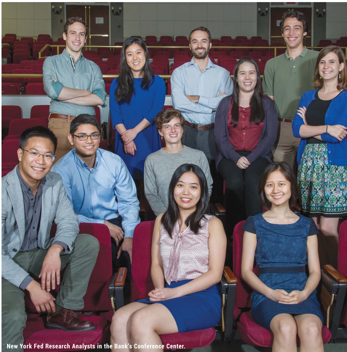
New York Fed Research Analysts in the Bank's Conference Center.