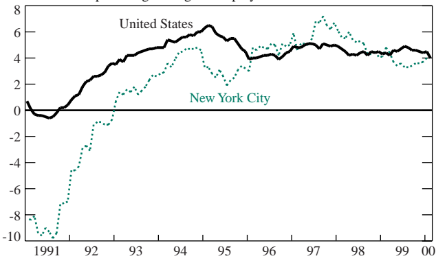
Chart 2 Business and Consumer Services Employment in New York City and the United States

Twelve-month percentage change in employment