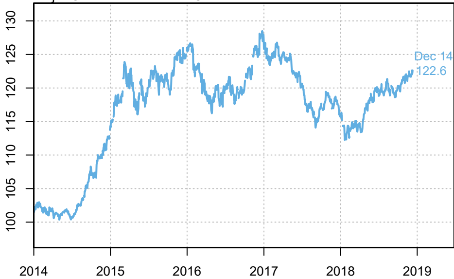
U.S. dollar (nominal) Major Currencies Index - 7 Currencies