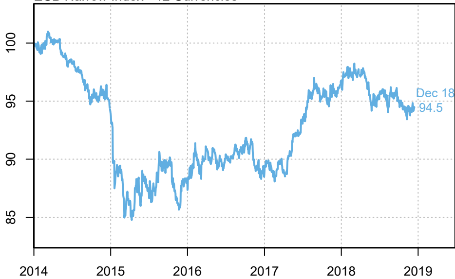
Euro area euro (nominal) ECB Narrow Index - 12 Currencies