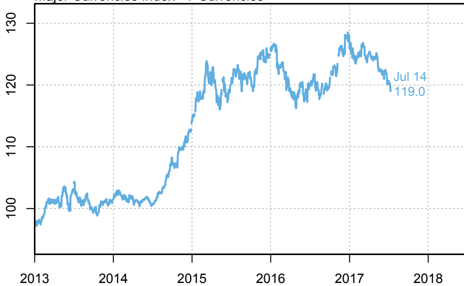
U.S. dollar (nominal) Major Currencies Index - 7 Currencies