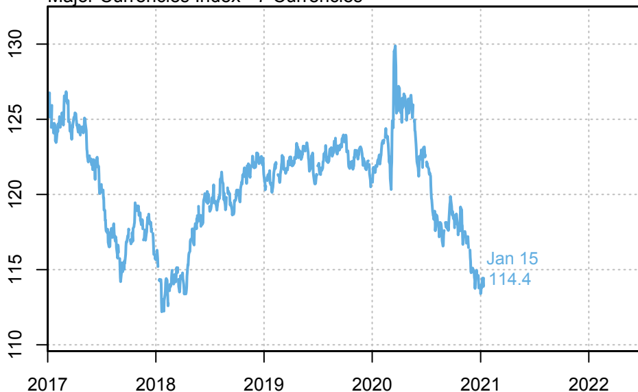
U.S. dollar (nominal) Major Currencies Index - 7 Currencies