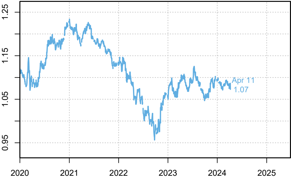
Dollars per Euro