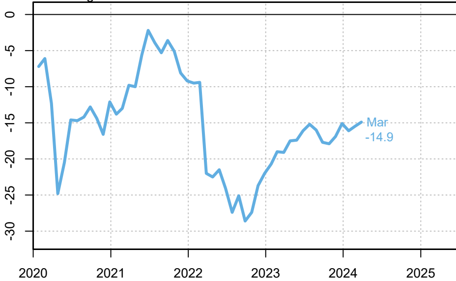
Consumer Confidence Percentage Balance