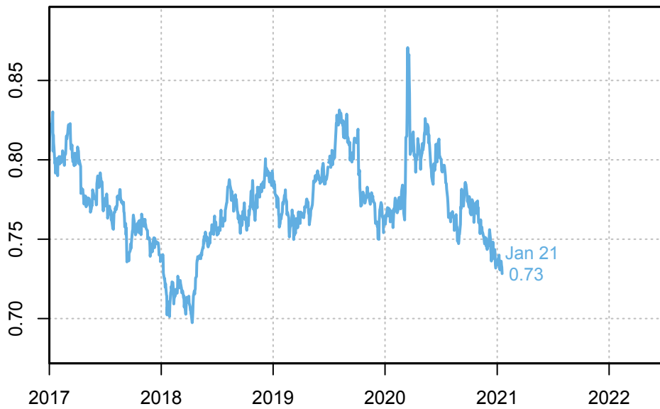
Pound per Dollar