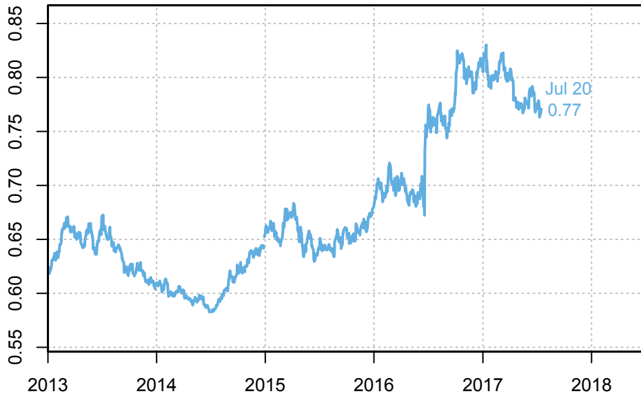
Pound per Dollar