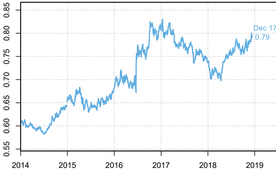
Pound per Dollar