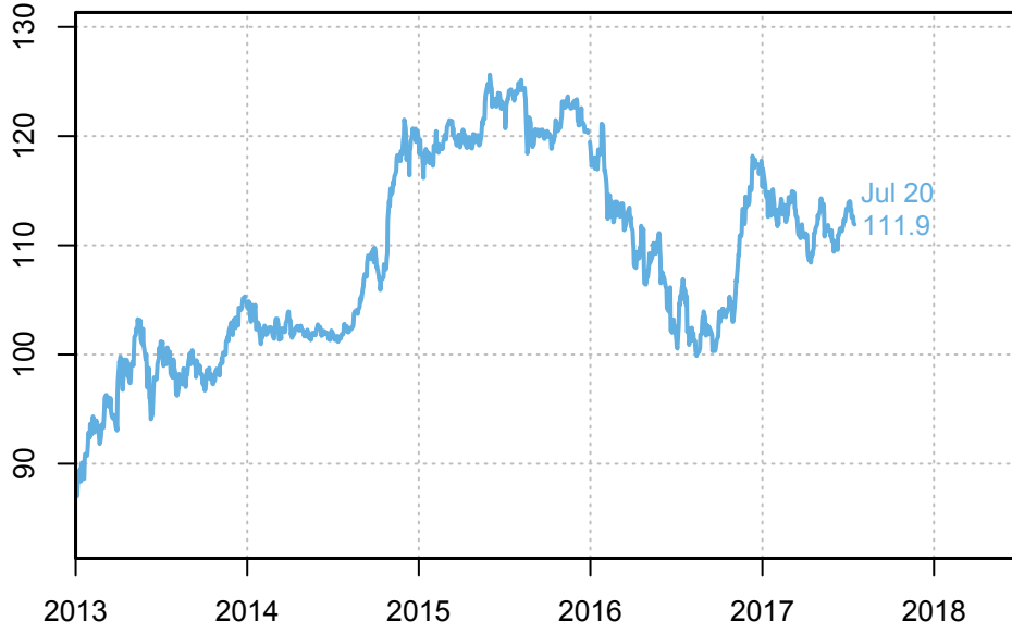
Yen per Dollar