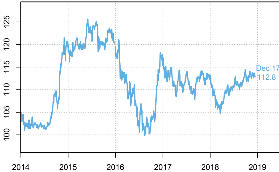
Yen per Dollar