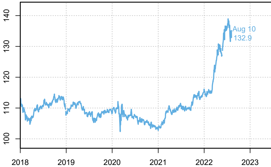
Yen per Dollar