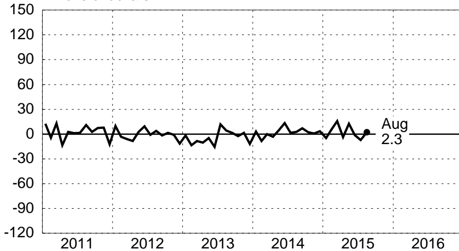
Capital Account and Net Errors and Omissions Billions of dollars