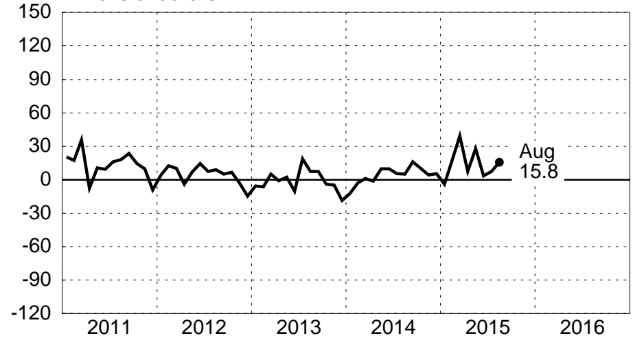
Financial Account Billions of dollars