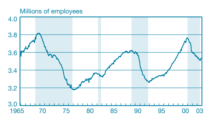
CHART 1 Employment in New York City

The attacks occurred as a recession was already under way in the nation and the city. Employment in New York peaked in December 2000 and had declined by 60,000 jobs by August. Another 100,000 jobs were lost between August and October 2001 (Chart 1). The New York City CEI began falling as the local recession commenced in January 2001 and declined nearly 0.95 percent in September 2001 alone (Chart 2). This was the fourth-largest monthly decline in the history of the index. While the CEI continued to decline until August 2003, the total peak-to-trough decline totaled 8.9 percent, which was significantly less deep than those registered during the city downturns that began in 1969 and 1989. In addition, the rates of decline before September 2001 and after are approximately the same, suggesting that the ongoing national recession was an important factor in the adverse outcomes experienced by the city economy. For this reason, isolating the effect of the cityspecific shock that struck New York on September 11 requires controlling, to the extent possible, for the effects of the ongoing national recession. In the analysis that follows, we accomplish this by normalizing our results by changes in the national economy. We thus seek to isolate differential New York City effects from changes in the national economy as a whole, whether attributable to 9/11 or to other factors.