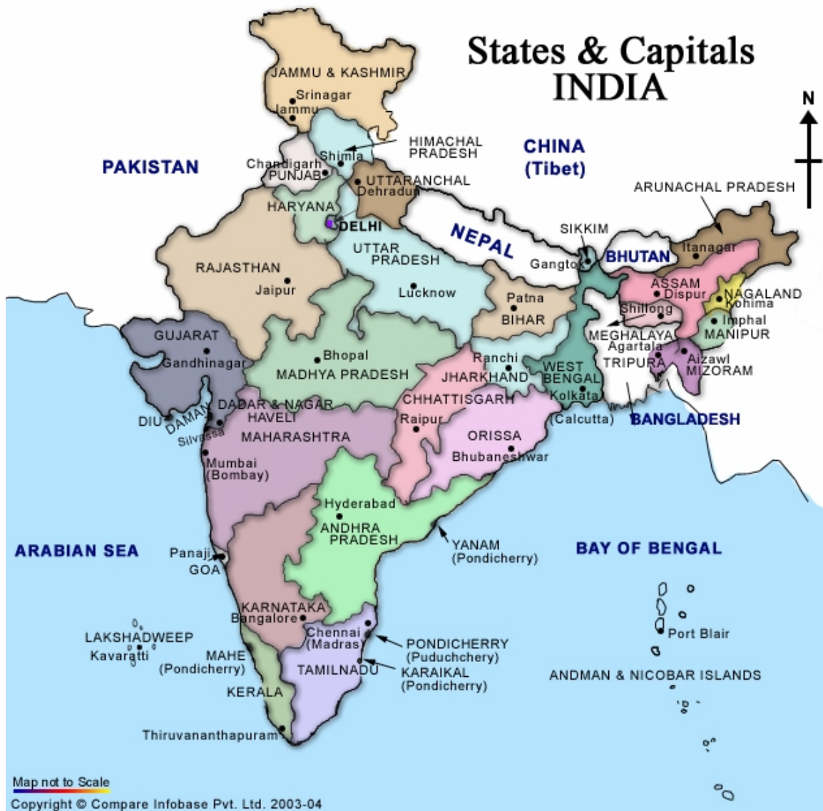
Figure 1. Political Map of India showing the different states as of 2004.

Notes: The names of states are in upper case letters (e.g. Madhya Pradesh), the names of the respective capital cities are in lower case letters (e.g. Bhopal). There are currently 28 states and 7 union territories in India.