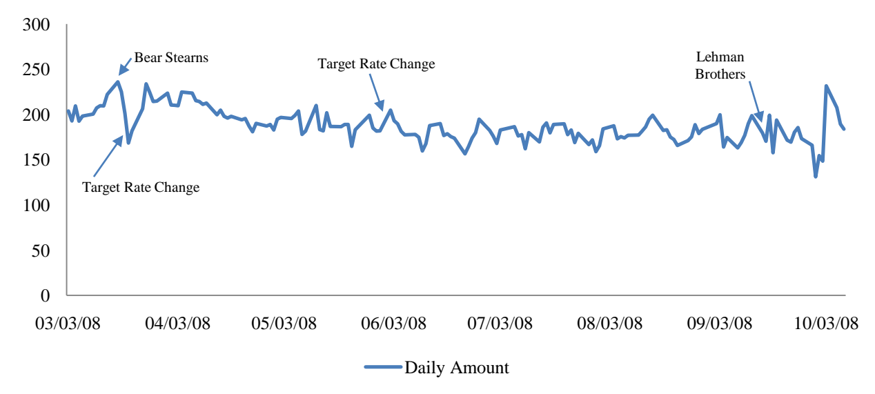
Figure 1. Daily amount of federal funds transactions ($ billions). The figure shows the aggregate daily amount borrowed in the fed funds market (in U.S. $ billions) from March 3, 2008 to October 8, 2008. The arrows indicate the following dates: i) March 16, 2008 – JP Morgan announces that it will acquire Bear Stearns for $2 a share, ii) March 18, 2008 – Federal Reserve Open Market Committee (FOMC) lowers target overnight federal funds rate 75 basis points to 2.25%, iii) April 30, 2008 – FOMC lowers target overnight federal funds rate 25 basis points to 2.00%, and iv) September 15, 2008 – Lehman Brothers files for bankruptcy after failing to find a merger partner.